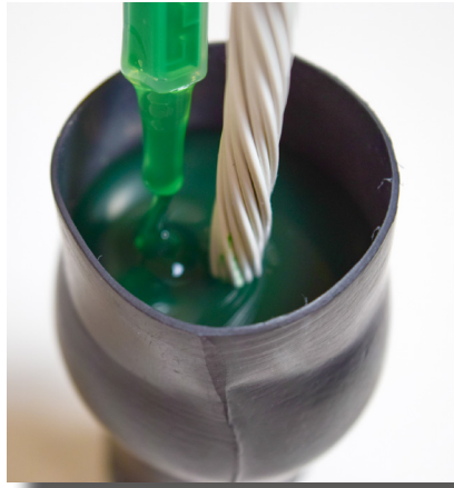
Self-Leveling Green® being injected to connector boot.